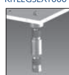
Available as optional KITLEGSEXT000