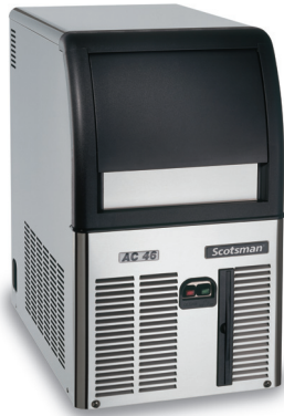
Routine Maintenance Alarm