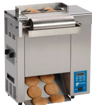
with motorized butter wheel and bun feeder