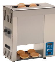
with heated base

For more than 25 years, the Vertical Contact Toaster has been a staple in foodservice operations, building a reputation for quality, performance, and reliability throughout the world.