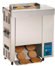
with wide mouth bun feeder