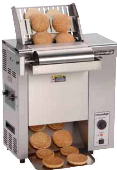
VCT-1000 with mechanical butter wheel and bun feeder

The Vertical Contact Toaster model VCT-1000 is designed for contact toasting of buns.