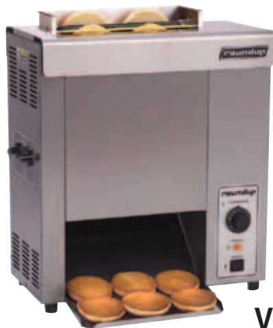
VCT-1000 with bun feeder